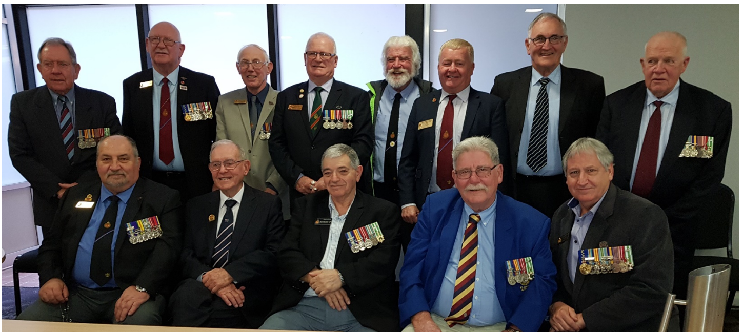
Photo Above: Vietnam Veterans Association of Australia Executive and State Presidents New South Wales, Victoria, Queensland, South Australia, Tasmania & Western Australia at National Congress in Canberra May 2018.